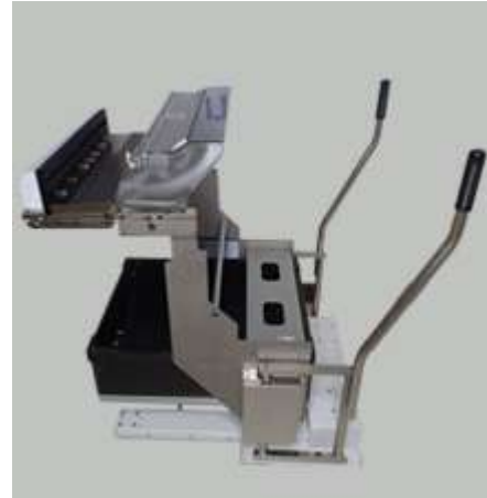
MFU for AIMEX