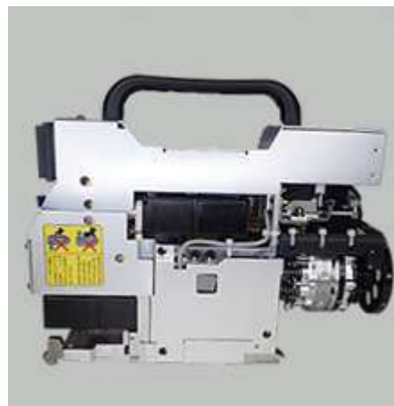
H08 Placement Head