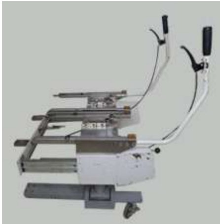
M3 Pallet Change Unit (Bucket Type)