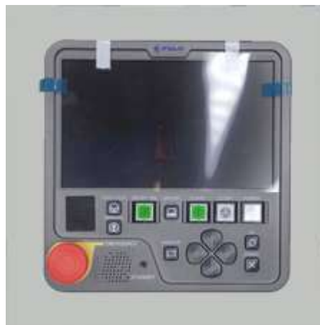
NXT Control Panel