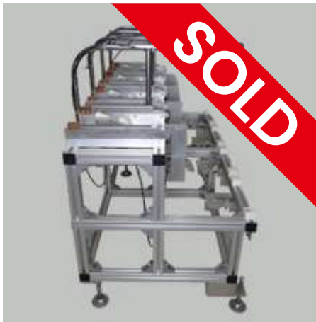
M3 Pallet Storage Unit