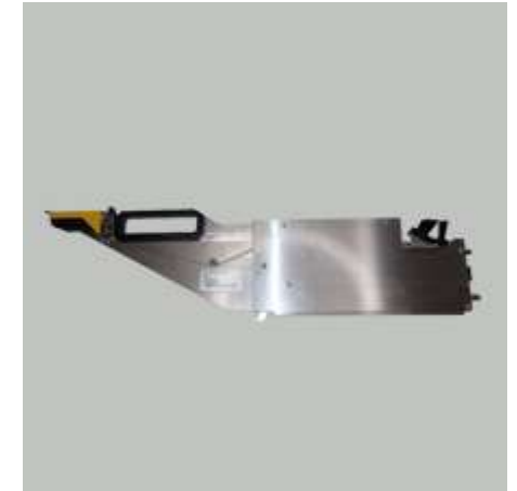
Jig Maintenance Feeder