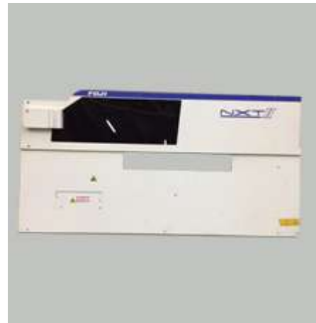
NXT-II Side Covers