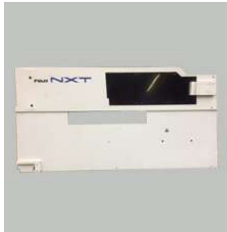
NXT Side Covers