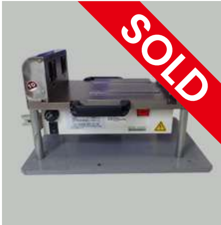
Reel Setting Stand