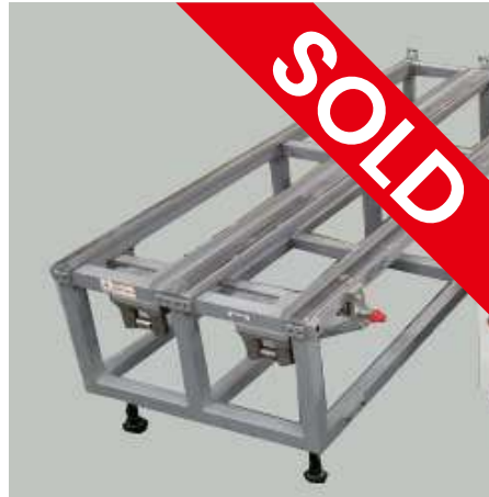
M3 & M6 Module Storage Unit