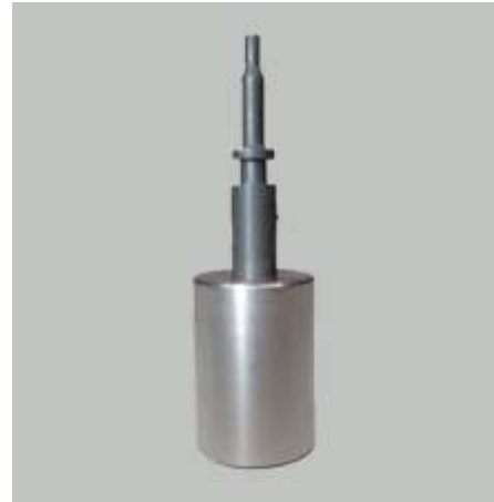
Pin Backup (Box of 8)