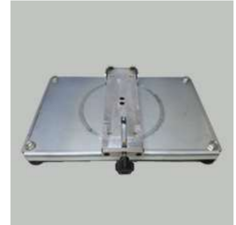
Head Maintenance Stand