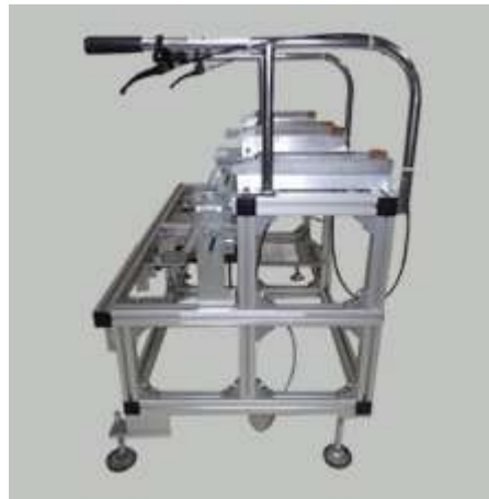
M6 Pallet Storage Unit