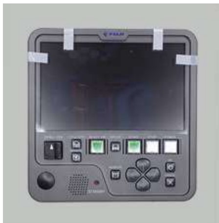
AIMEX Control Panel