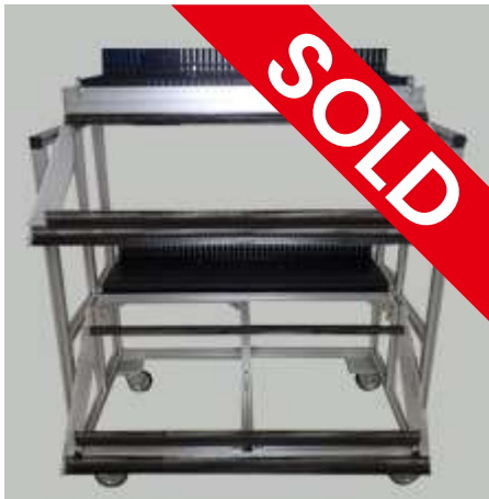
Feeder Storage Rack (Reel Type)