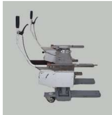
M6 Pallet Change Unit (Bucket Type)