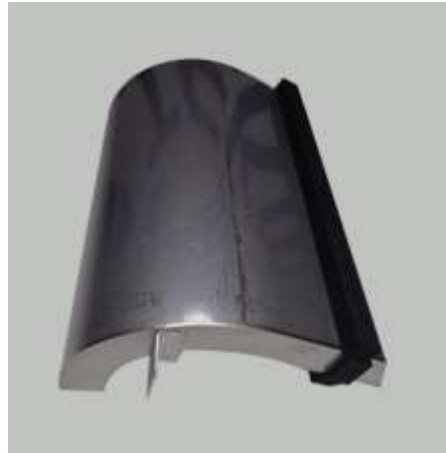
M3 Waste Tape Duct