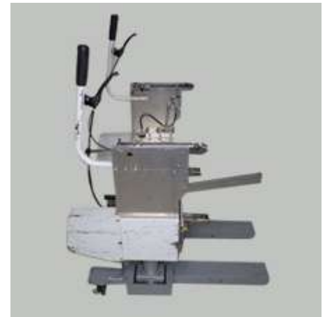
M6 Pallet Change Unit (Reel Type)