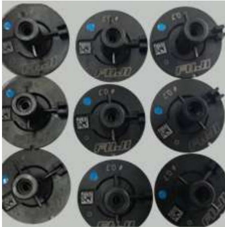
OEM NXT & AIM Nozzles