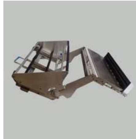
M6II Feeder Pallet