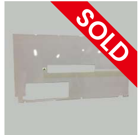
NXT Seamless Covers