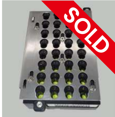
H12/H08 Nozzle Changer Nest